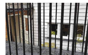
Elevation of External Terrace Wall