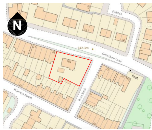
Scale 1:1250 Site Location