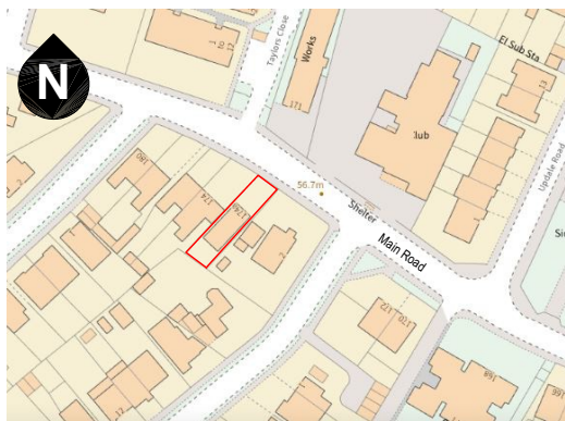
Scale 1:1250 Site Location